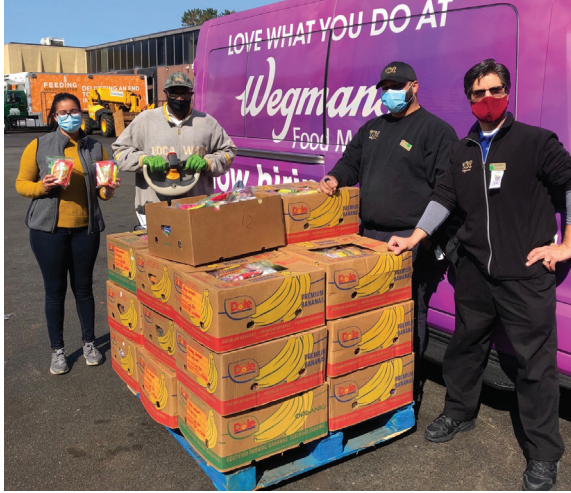
Wegmans' Leader of the Pack team

During September's Hunger Action Month, local businesses came together, while staying remote, to compete, pack bags, and raise money in our inaugural Leader of the Pack Corporate Challenge sponsored by long-time partner, Webster Bank. Thanks to participating teams from Morgan Stanley, Mutual of America, PepsiCo, PKF O'Connor