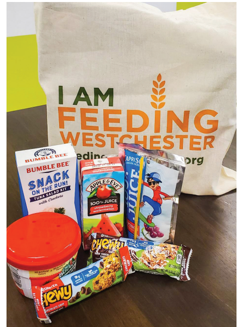
Over 3,000 bags distributed locally