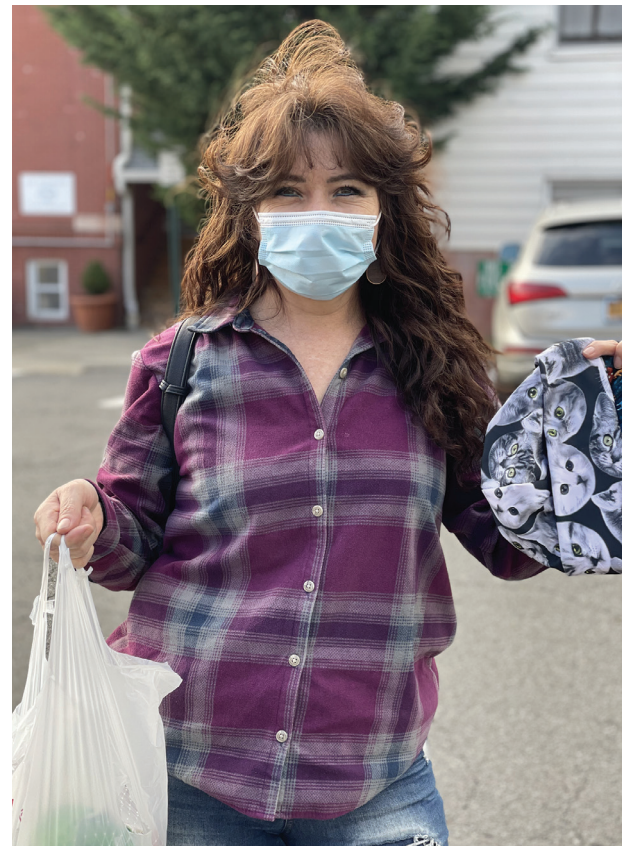
Receiving a turkey just in time for the holiday