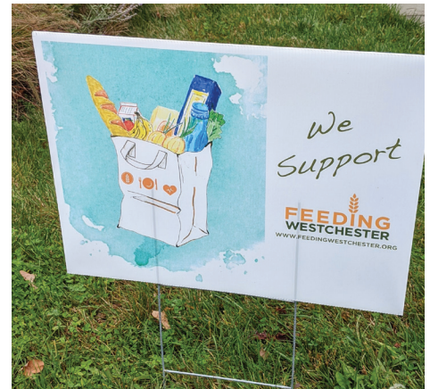
Feeding Westchester yard signs

The Community Fund of Bronxville - Eastchester - Tuckahoe, Inc. awarded